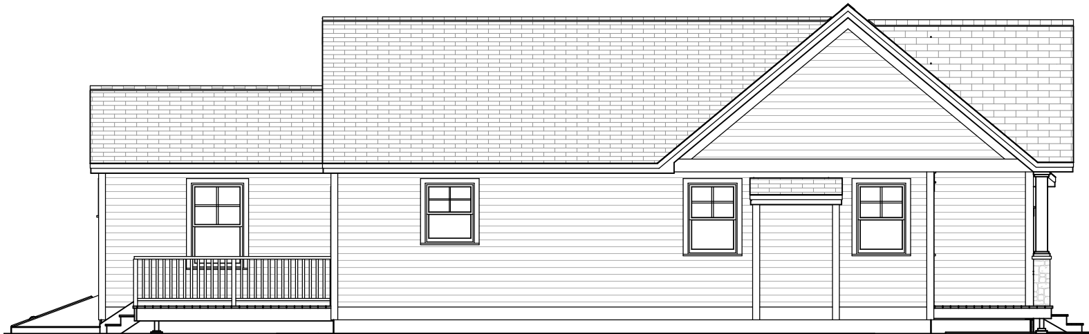
Left Elevation Scale: 1/8" = 1'-0"