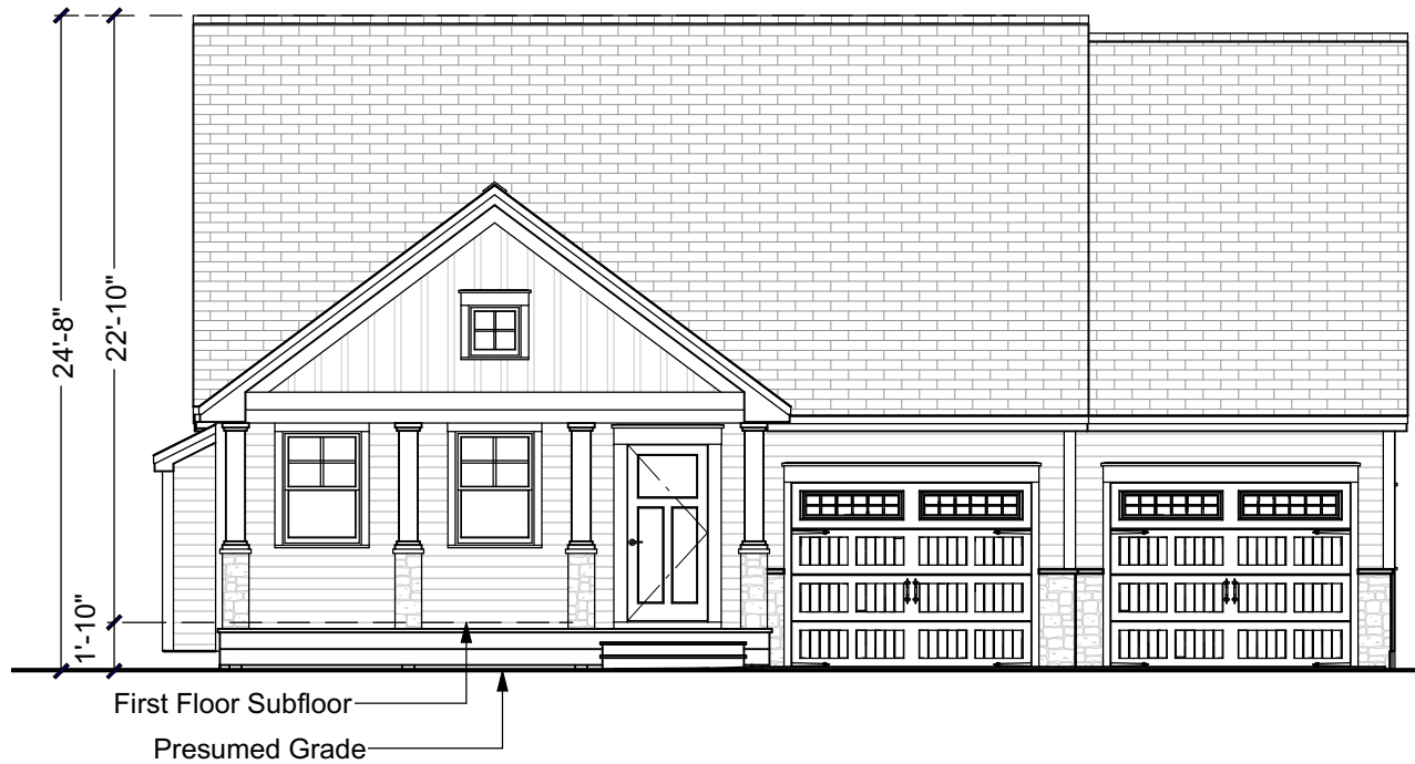
Front Elevation Scale: 1/8" = 1'-0"